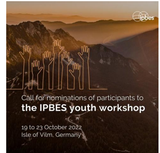
[Graphic: The Open-ended Network of IPBES Stakeholders - Onet]