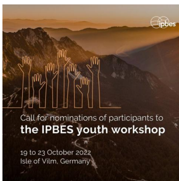
[The Open-ended Network of IPBES Stakeholders - Onet]

An IPBES Youth Workshop with regionally balanced participation from all UN regions took place from 19 - 23 October 2022 at the International Academy for Nature Conservation (INA), Isle of Vilm / Germany ( https://www.ipbes.net/ipbes-youth-workshop-2022 ). It proved to be a very useful format for capacity building on IPBES processes, procedures, outcomes, ways of participation in IPBES, and active testing of tools developed under IPBES, such as the Nature Futures Framework. Currently attractive outcomes including publications and a graphic novel are being prepared. The workshop was co-funded together with Norway and co-organised together with the TSU on Capacity Building and Germany is ready to support future IPBES Youth Workshops.